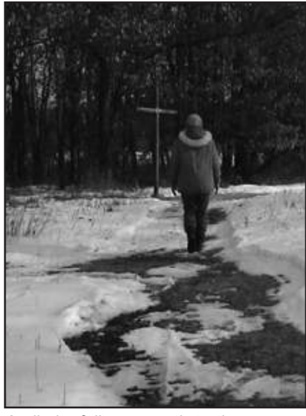
A pilgrim follows a path to the cross at the edge of the prairie, a favorite destination of hermits at Pacem.

We arrive—it is a gentle entry into our heart. We rest in the stillness of God's love and we know hope as we have "sips" of the joy of the Resurrection. Our spirit sings, "Alleluia! Alleluia!"