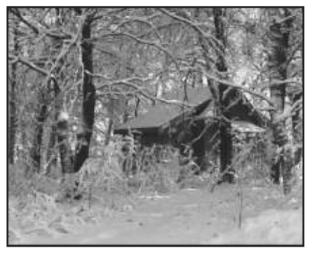
The hermitage area after a late winter snow has a special quiet and beauty.