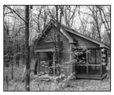
And the hermitage area in early spring is a wonder to behold, as well!

It read: We know who you are but we don't know what you are.