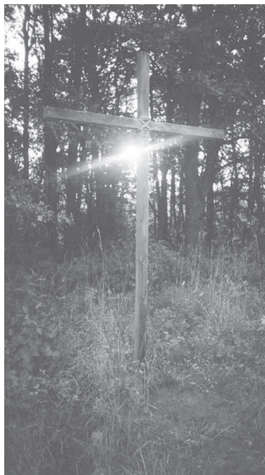
The Glory of the Risen Lord

Remember, being a Pacem Ambassador has no term of duty—it is simply being an available instrument to proclaim God’s love. ♦