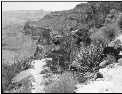
Breathtaking view at the Grand Canyon

our experience recently. We both agreed that God wanted to show us the beauty of the desert and how awesome our time there can be with Him. The perspective God has given us is something we could easily have missed had we preoccupied ourselves on the drive to the Canyon. We are anxiously awaiting our next trip to the desert whether it is to the Grand Canyon or to the hermitage. It should prove to be equally stunning and breathtaking.