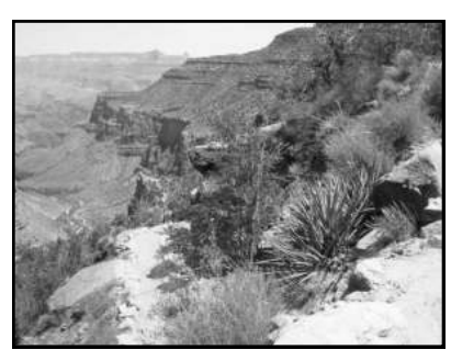
Breathtaking view at the Grand Canyon

our experience recently. We both agreed that God wanted to show us the beauty of the desert and how awesome our time there can be with Him. The perspective God has given us is something we could easily have missed had we preoccupied ourselves on the drive to the Canyon. We are anxiously awaiting our next trip to the desert whether it is to the Grand Canyon or to the hermitage. It should prove to be equally stunning and breathtaking.